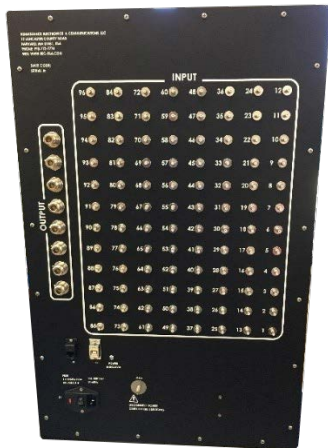
18A6BAF 8 X 96