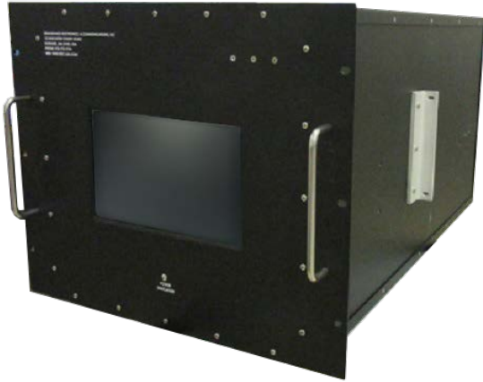
18A6BAY 24 X 12