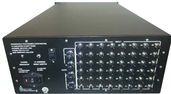
18A6BAC 4 x 48